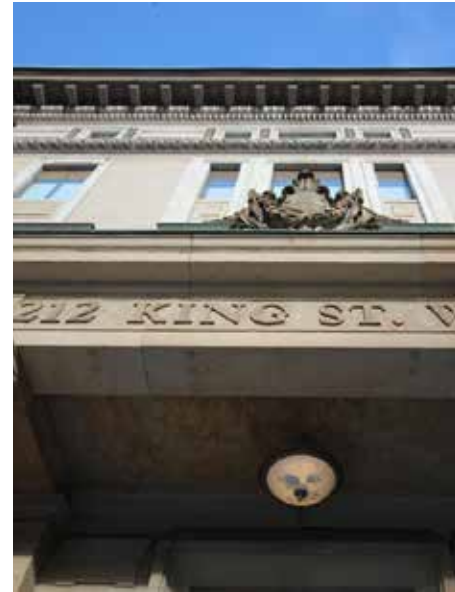
KING STREET W & SIMCOE STREET