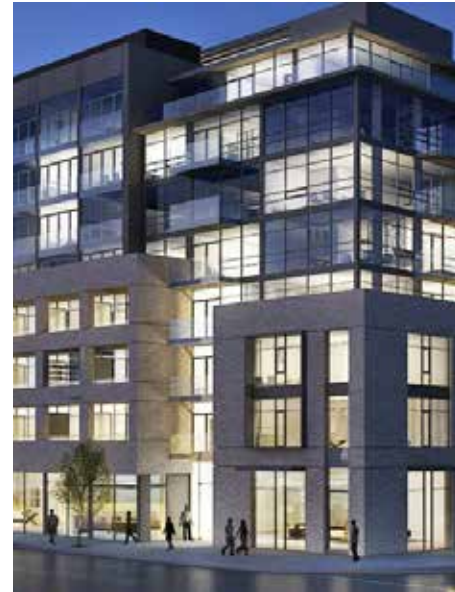
QUEEN STREET E & DAVIES AVE