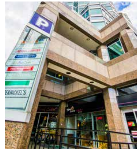
📍 BAY STREET & ELM STREET