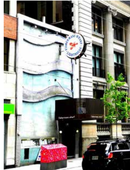
RICHMOND STREET W & BAY STREET