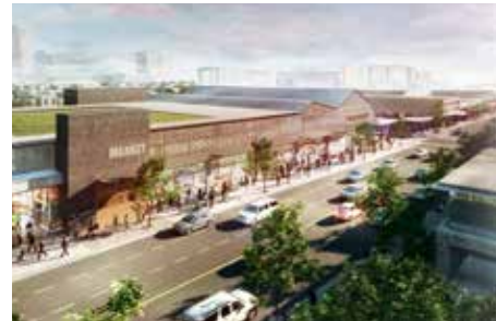
MISSISSAUGA ROAD & LAKESHORE ROAD W