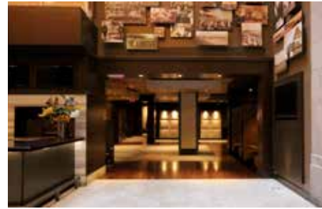
📍 BAY STREET & ADELAIDE STREET W