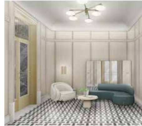
rendering is artist's concept E.O.E.