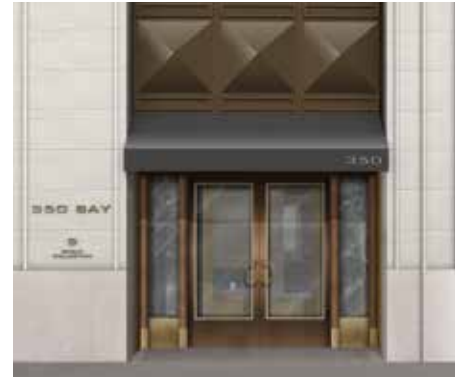
rendering is artist's concept E.O.E.