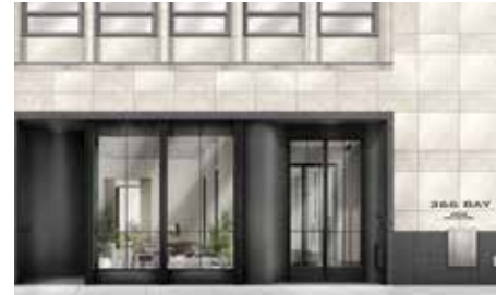
rendering is artist's concept E.O.E.