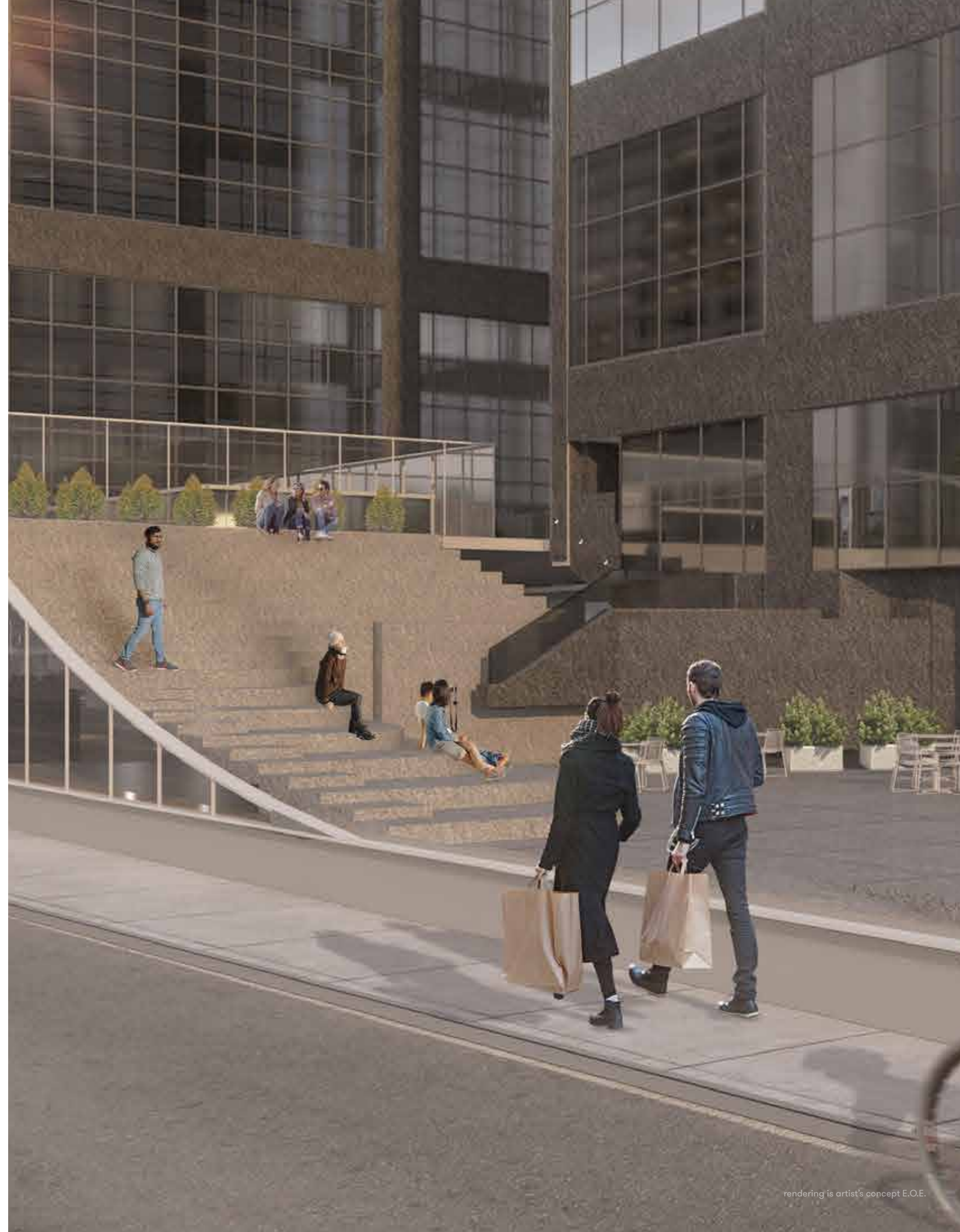
rendering is artist's concept E.O.E.