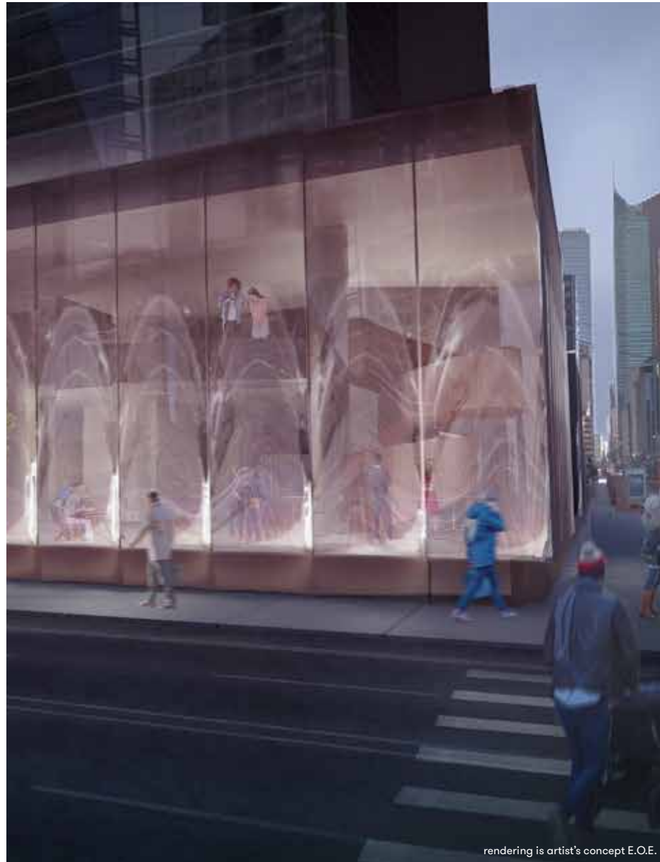
rendering is artist's concept E.O.E.