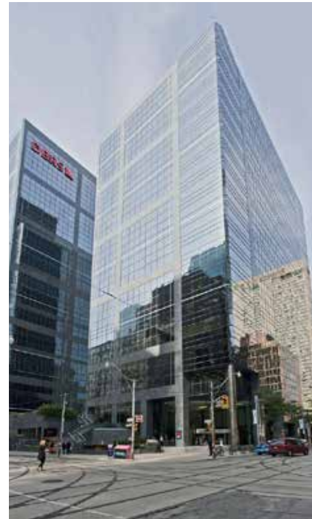
UNIVERSITY AVENUE & ADELAIDE STREET W