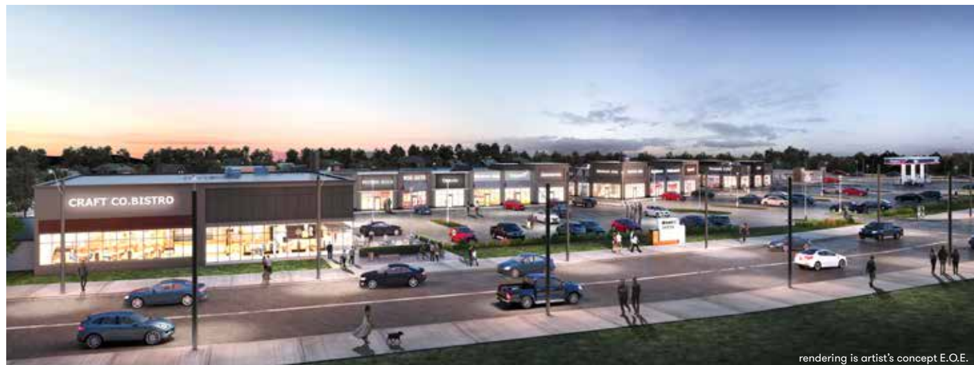
rendering is artist's concept E.O.E.